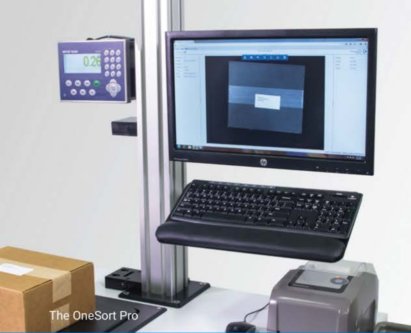
The OneSort Pro