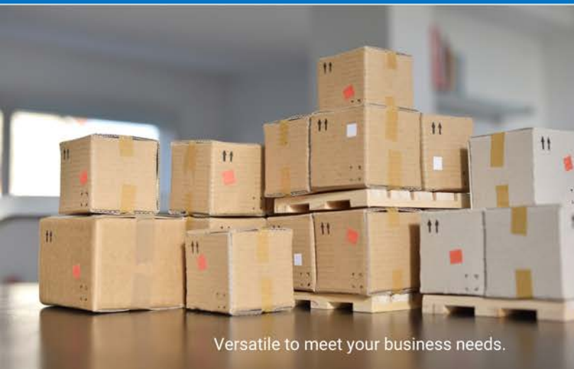
Versatile to meet your business needs.