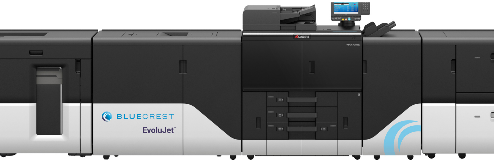
EvoluJet is based on the Kyocera TASKalpha Pro 15000c